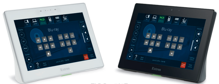
TLP Pro 725T 7" Tabletop TouchLink Pro Touchpanel