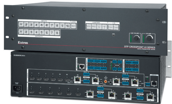
DTP CrossPoint 108 4K