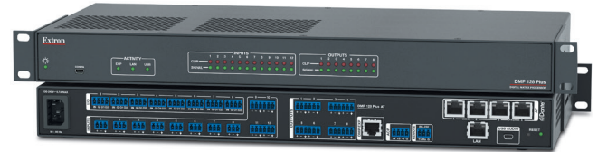
DMP 128 Plus AT