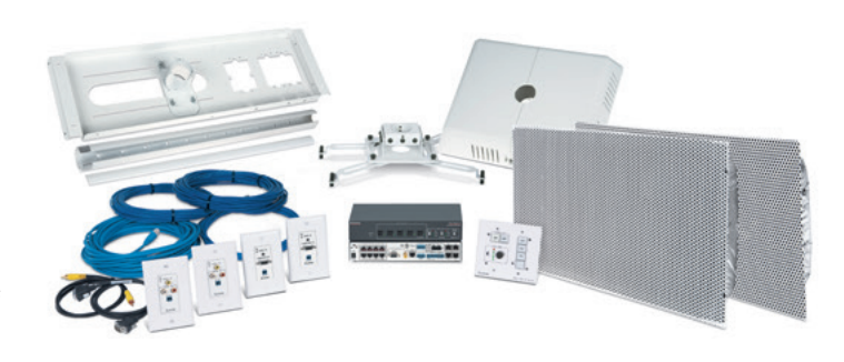
PoleVault is a complete classroom AV switching and control system.

The district expressed satisfaction with every step of the process, from purchasing to installation and usability. If given the chance to consider an alternative solution, Doerr shared that he wouldn't change a thing. "Our experience with Extron has been great and PoleVault is the right solution for any school that needs to be self-sufficient."