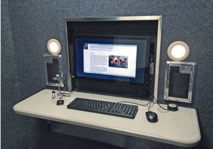
Usability testing can be monitored from the Super Booth as well as within the collaboration space, simultaneously.