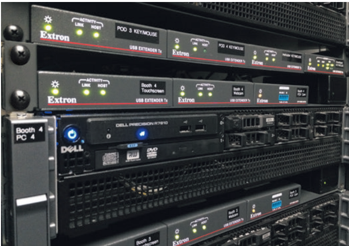
An Extron SMX System MultiMatrix with USB matrix boards and USB Extender units enable KVM signal extension and routing throughout the lab.

Instructors often comment on the convenience of the small magnet that holds the tilt-up lid open on the enclosure and having a power outlet available at the table.