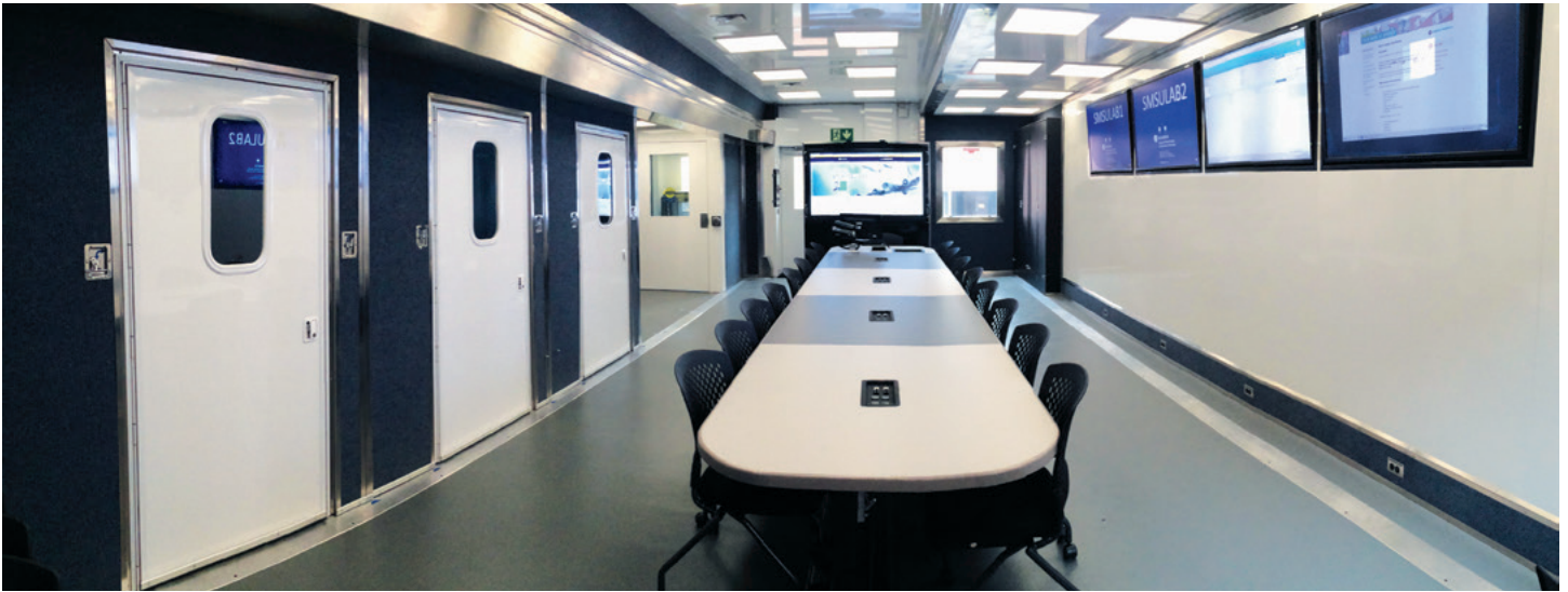
The collaboration space allows the content creators to observe and analyze user response to material viewed in any of the five usability testing booths.