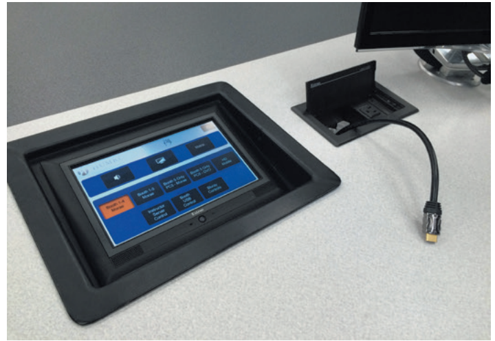
Pod 5 of the collaboration space table provides complete AV system control plus AV connectivity for portable AV devices.

some of the first programs to incorporate usability studies into the curriculum. As part of the coursework for Broadcast Operations, the AV system also supports monitoring of the college's mobile HD Truck. The lab is easily transported around campus as well as to the offices of Humber's industry partners, which include companies that wish to evaluate and use designs and content developed by the college.