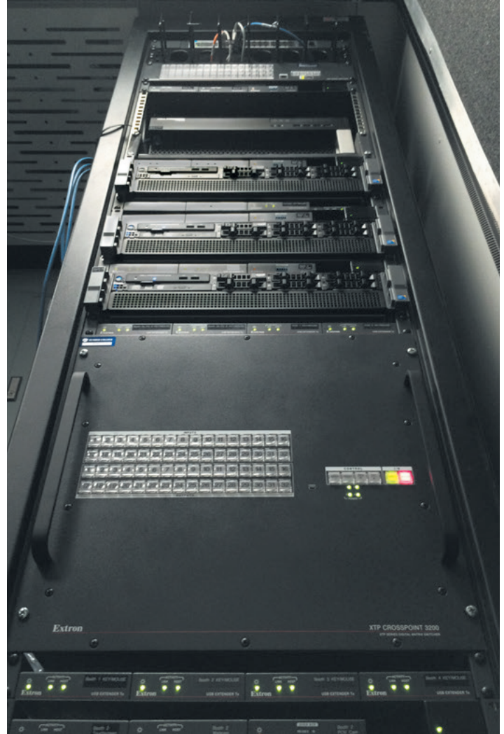
The Extron XTP CrossPoint 3200 matrix switcher provides switching and distribution of HDMI, audio, and control signals to local and remote locations.

From Pod 5, the instructor is able to monitor and control AV functionality within each booth, as well as the collaboration space, using an Extron TLP Pro 1020M, a 10" TouchLink® Pro Series touchpanel. It provides the flexibility to select between different live views, including from a booth's GoPro camera and the Eye Tracker system, and sharing subject content plus testing feedback on any combination of displays. Program and live audio are also controlled from this single touchpanel. The wall-mount touchpanel is embedded flush to the table, so as not to be an obstruction during collaborative sessions.