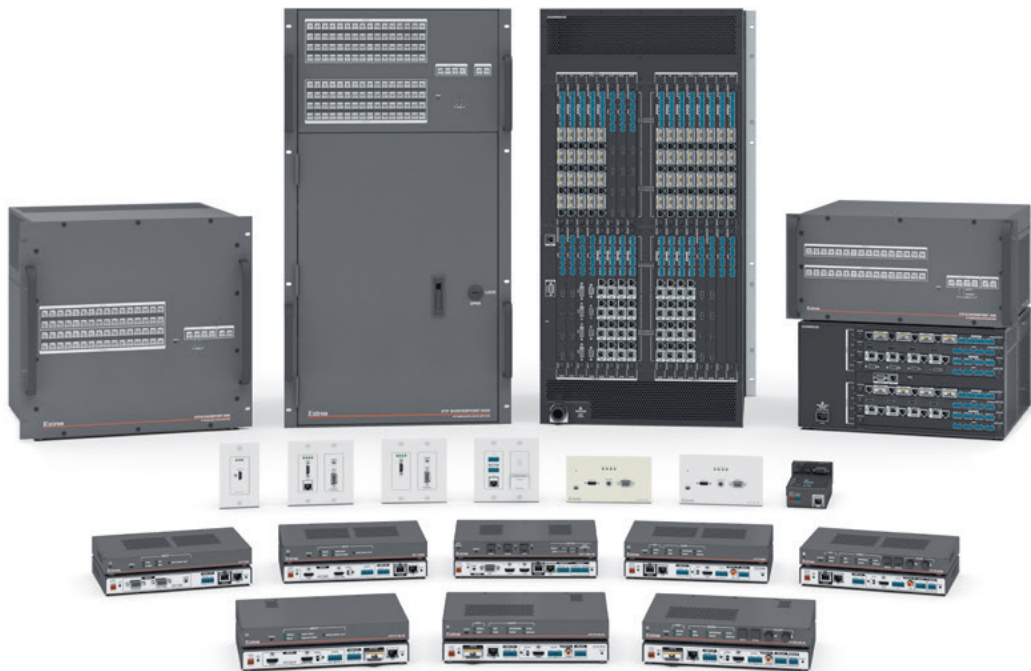
XTP Systems offer the needed scalability and flexibility to support 4K video applications and beyond.