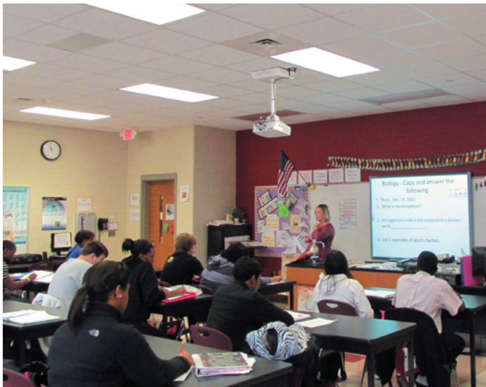
Extron PoleVault Systems securely mount AV equipment near the projector, freeing up valuable floor space.

Today, Franklin County Schools has more than 300 Extron PoleVault Systems installed and connected to the network. Each classroom system is nearly identical. This uniformity has made it easy to train teachers in how to use the technology. Having fixed system installations in every classroom has allowed the schools to reclaim valuable floor space that was previously taken up by carts of equipment. Cables are no longer stretched across the floor, so the trip hazards have been eliminated, as well.