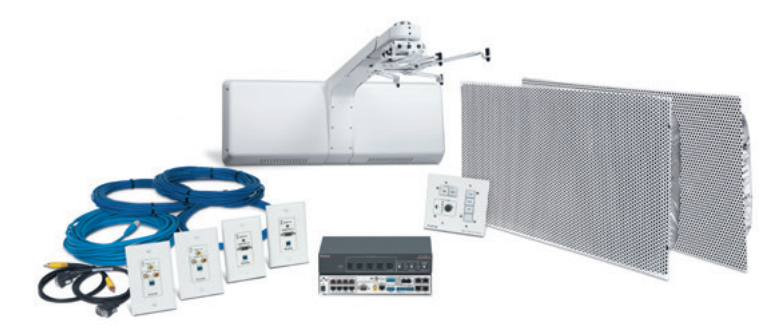
WallVault Systems are easy-to-use, network-enabled, all-inclusive AV switching and control packages, making them ideal for single-display K-12 classrooms.