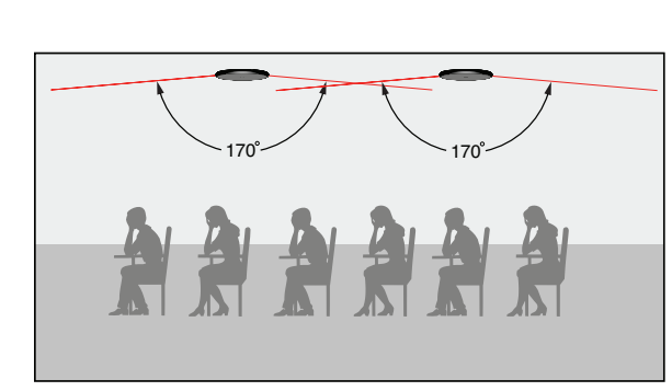
For a typical classroom, use wide dispersion speakers for even coverage.

RF systems provide uninterrupted coverage within the range of the radio signal, typically about a 40x40 foot area. Instructors can be heard though the system speakers, whether they are facing the class in a brightly lit classroom, or talking into the whiteboard. But the instructor must be mindful to mute the mic to avoid broadcasting conversations when stepping out of the classroom and still within radio range. Modern RF mics operate in a license-free radio band. They employ digital radio technology that provides superior sound quality, feedback suppression, and transmitter-receiver channel pairing that prevents interference between mics in adjacent rooms, or interference with other nearby wireless RF devices.