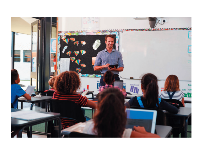
Instructors must overcome numerous acoustical barriers to learning in order to effectively deliver instruction.